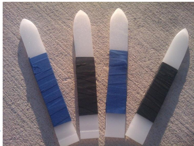
Plastic or poly breaking sticks