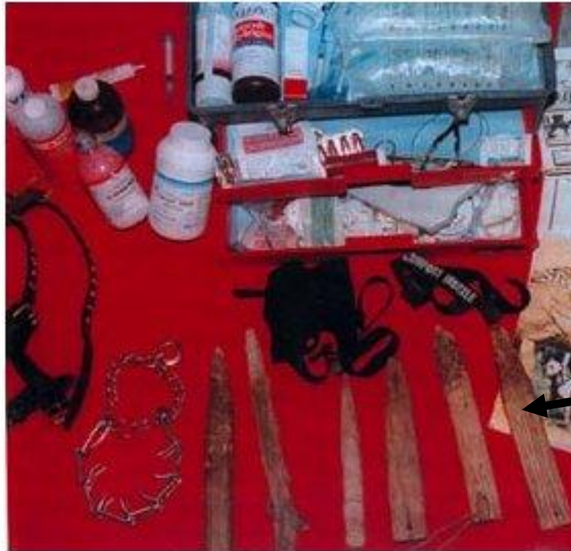
Wood breaking stick